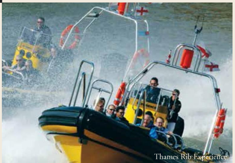
Thames Rib Experience

A spectacular round trip in central London incorporating gut busting guided commentary on the sights, followed by the ultimate adrenaline high-speed RIB boat experience. The perfect way for a team building activity or to thrill your clients.